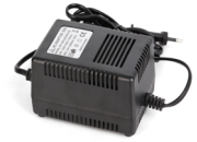
AC24V/3A Power Supply